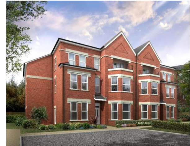
Proposed View from Palace Road